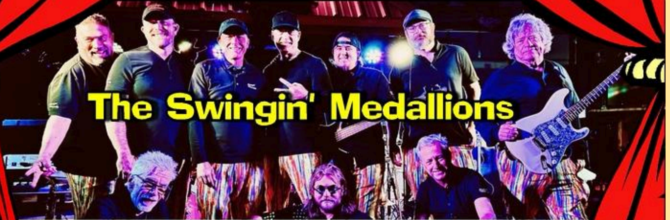
The Swingin' Medallions