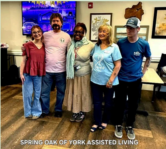
SPRING OAK OF YORK ASSISTED LIVING